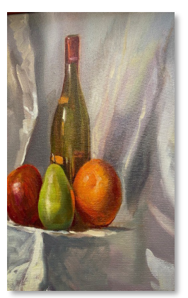
Wine with Pears

We have had a wonderful series of Artist of the Month pieces that highlight the incredible talent of our members.